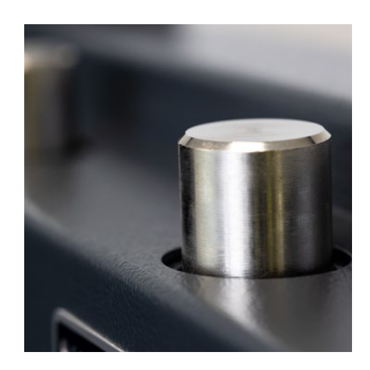
AVAILABLE IN 3 COMPACT SIZES