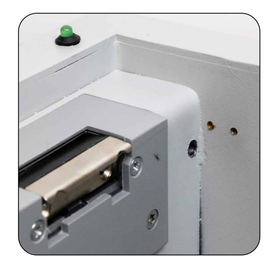
Step 5. Drill the marked hole using an 8mm dia HSS drill bit through both the LH outer safe body and the internal partition (make sure there are no wires in the area you are drilling)