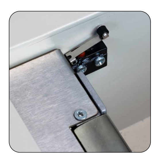
Step 7 Fix the DC1C-C3LB Micro Switch to the key safe body using two M2.5 x 10mm Set Screws