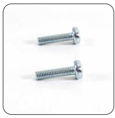
M2.5 x 10 Set Screw