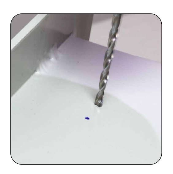
Step 2. Drill the marked holes 2mm dia with a HSS drill bit.