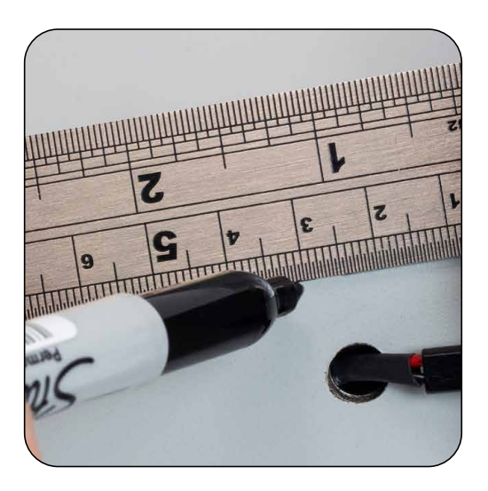
Step 4. From the LH Side mark back 32mm back from the flange and 8mm down from the top of the safe body.