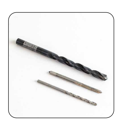
8mm HSS Drill Bit M2.5 TAP 2mm HSS Drill Bit

A fantastic and well priced safe that will manage the access and usage of all your important & critical keys.